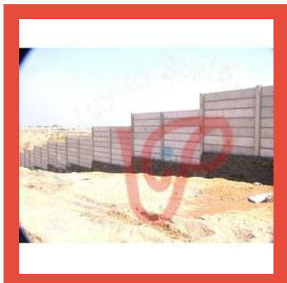
Readymade Boundary Wall