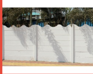
Precast Concrete Compound Wall