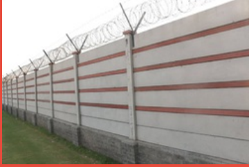
Prefabricated Boundary Wall