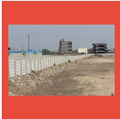
Solar Boundary Wall