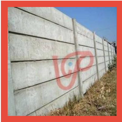
Ready Made RCC Wall