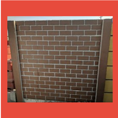
brick design compound wall