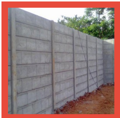
RCC Folding Concrete Compound Walls