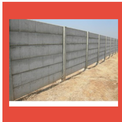
Cement Boundary Wall