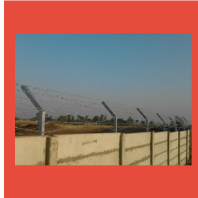
Concrete Precast Compound Wall, Built Type Panel Build