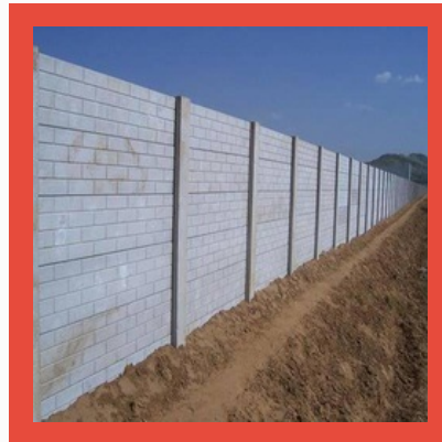
RCC Boundary Wall