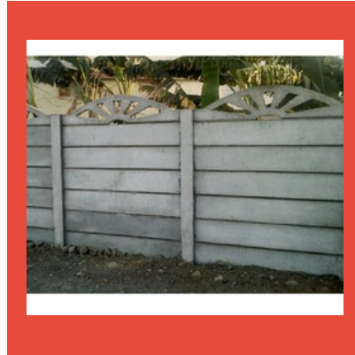
Pre-Cast Pre-Stressed Boundary Wall