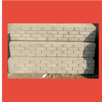
brick precast compound wall