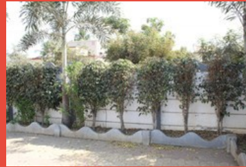
RCC Precast Garden Wall